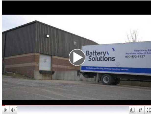
Watch this short video on battery recycling.

231-941-5555 | recyclesmart@grandtraverse.org | www.recyclesmart.info